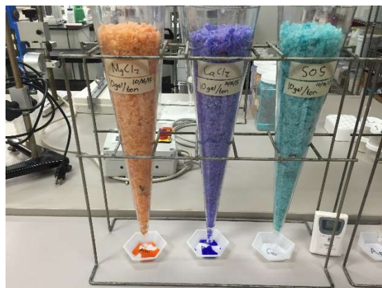
Figures 1 and 2: Imhoff cones filled with treated salt; Illustration of product leaching. (Treatment liquids dyed for visibility.)